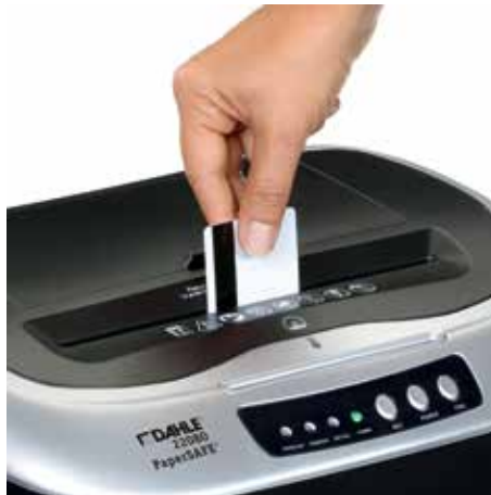
Suitable for shredding cheque cards and credit cards