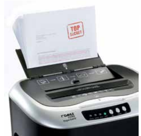
Practical function for shredding stacks of up to 80 sheets of 80 g/m 2 paper