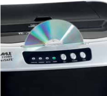
Separate feed opening for securely shredding CDs and DVDs