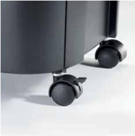
Convenient swivel casters with brake for reliably keeping the document shredder firmly in place