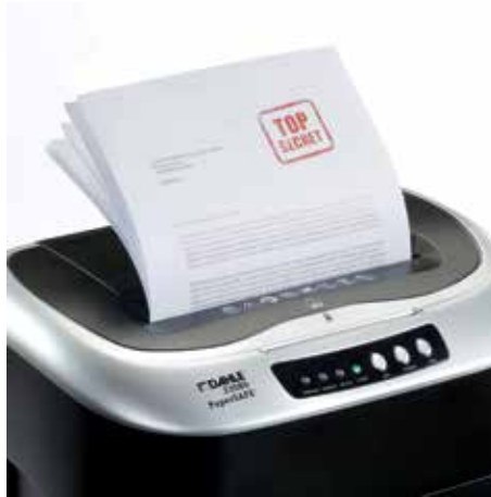
Manual paper feed of up to 6 sheets 80 g/m 2