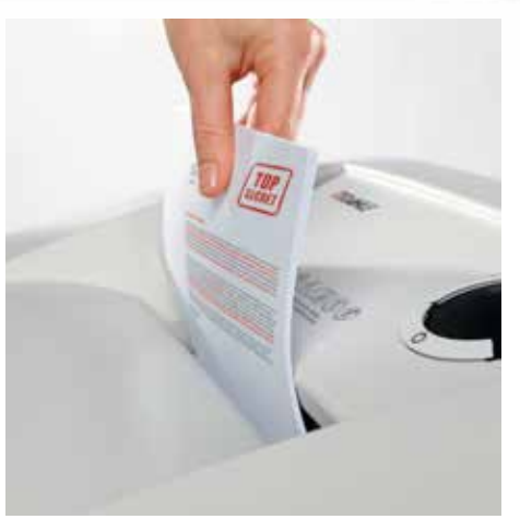
Innovative MHP technology® shreds up to 30 % more paper