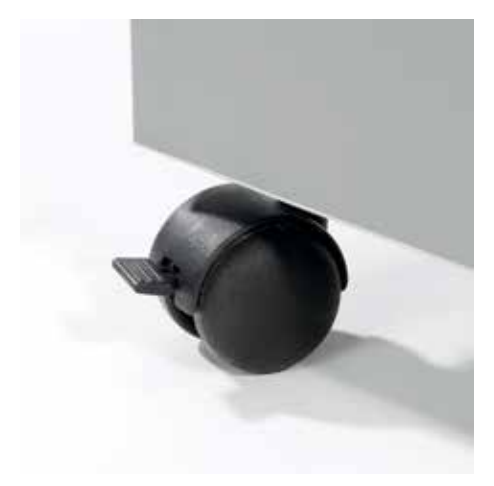
Practical swivel casters for flexible use