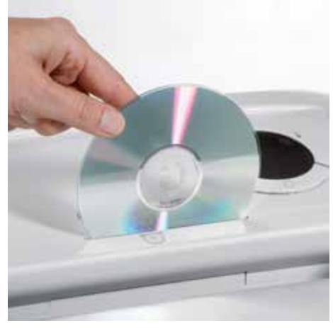
Separate feed opening for CDs, DVDs, cheque and credit cards guarantees reliable shredding of optical, magnetic and/or electronic data carriers