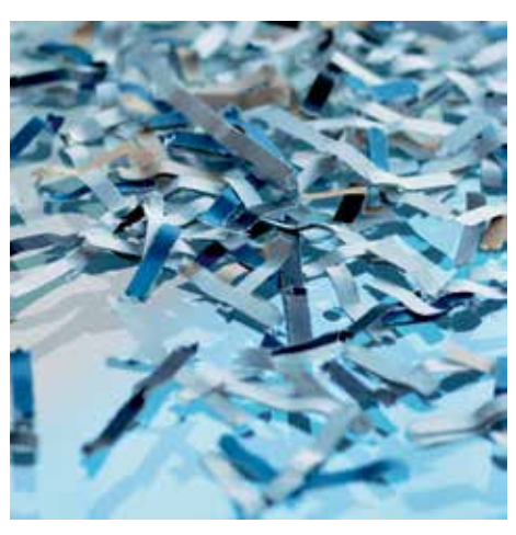
P-4 security: recommended, for example, for data media containing particularly sensitive, confidential and personal data