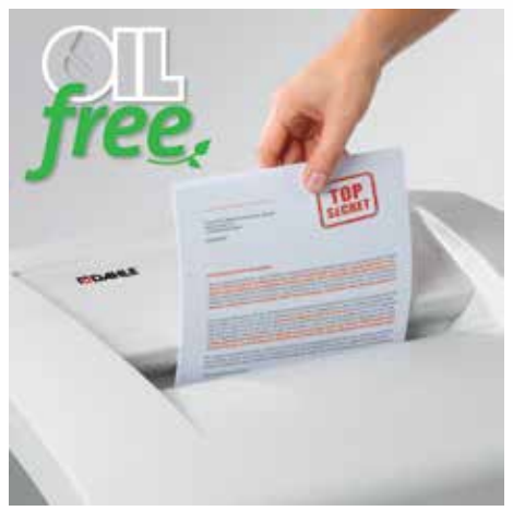
Shredding the convenient way, all without the time-consuming process of oiling the cutters